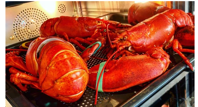
plus convection steam, speed ovens, ventilation and more!