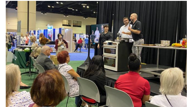
National Association of Realtors, Sustainability Chef Stage