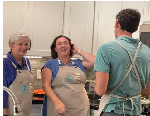
Ambassador hosting a home tour with Congresswoman Porter & Secretary Granholm