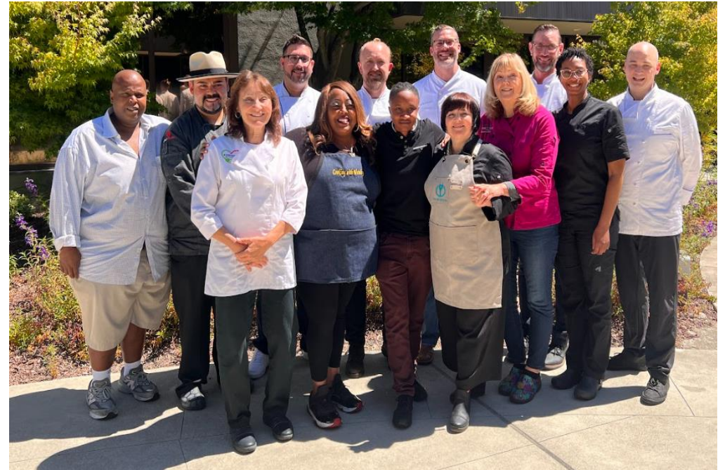
1st Chefluencer Program: A gathering of 13 chefs from CA and across the US in July 2023