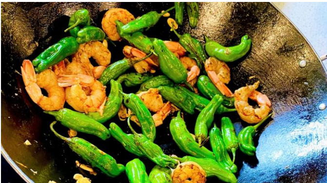
From wok cooking, charring and searing to...