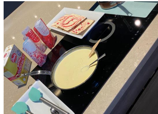
... simmering, reheating and melting on induction