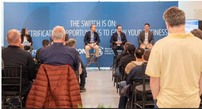
Convening with contractors