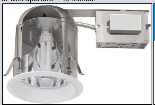
Figure 2: Examples of excluded downlights without a built-in or integral LED module or with aperture > 10 inches.