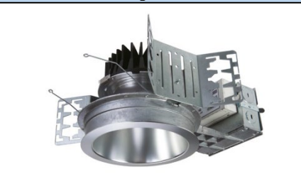
Figure 1: Examples of included downlights and downlight retrofit kits intended to be recessed in a ceiling.